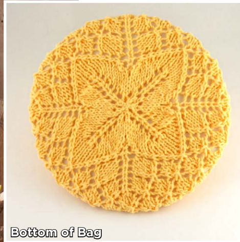
Bottom of Bag