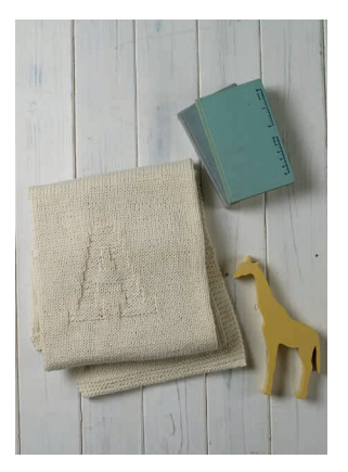
A to Zzz Blanky FREE