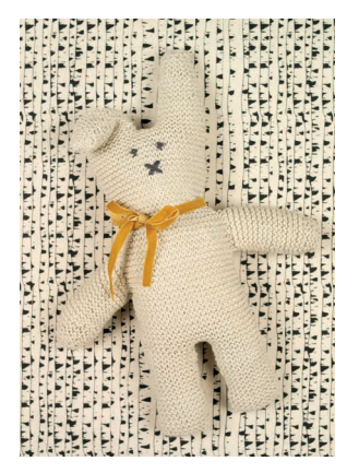
Cottontail Rabbit FREE