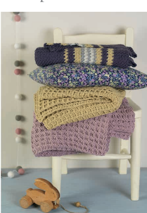
Muffin Rhubarb & Waffle free patterns available from www.erikaknight.co.uk