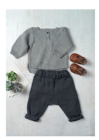
Pop & Treacle