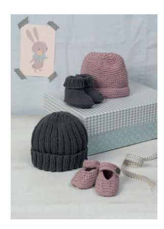
Bubble & Squeak