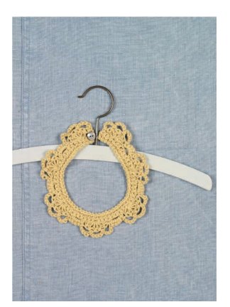
Curly Wurly FREE