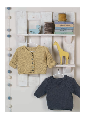
Jammy & Dodger